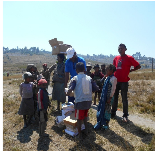
Students carrying the books down to the school

When we came to Antsomaina after a rather hard trip on a bad road, we were greeted by pupils and teachers, and they started carrying the books down to the school. A teacher was about to make the cement floor in one of the classrooms as the school cannot afford to pay workers for this.