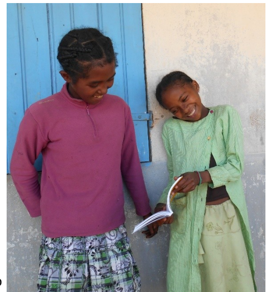
Two friends having fun with looking at the pictures in the book and discussing what the content might be

The teachers were very eager to read the book themselves, and they also assured us that this is a chance they have never had before. Even the teachers are not used to reading books at all, so also for them, this opens a whole new world. We hope to receive regular reports on their progress in reading, although we should not expect them to finish very soon as it might take much time to get through the book on top of the rest of the curriculum.