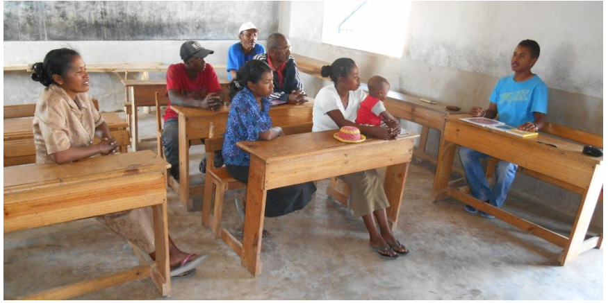
A fruitful meeting with the teachers

Especially for the older students who received a copy of Todisoa it was important for us that they will read it in school before they are left to read them on their own. This is to assure that they will find out how to read a novel of this length and not be discouraged by the amount of text. We have to remember that many of these students have never read a book before, and especially not a novel.