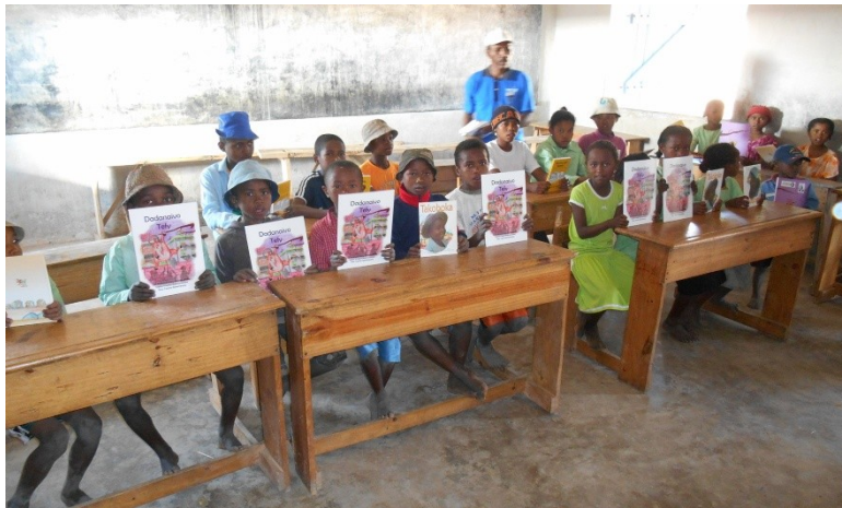
The smaller pupils with Dadanaivo

We decided that we would distribute one class set of Todisoa for the secondary school and one class set of Dadanaivo Tefy to the primary school, as we also still have some of this book left. In addition we gave each of the students who will finish secondary school this year, i.e. 9th grade, one Todisoa as their own property, and we gave those who will finish primary school this year, i.e. 5th grade, one Dadanaivo Tefy as well.